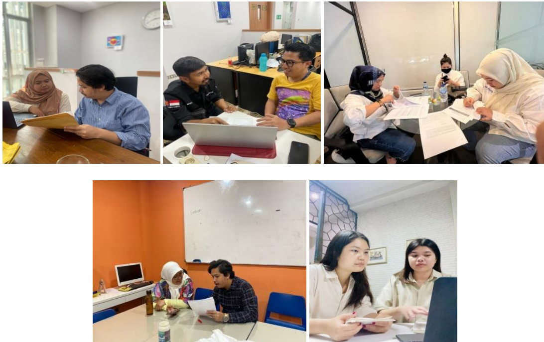
Figure 2. Interview with Scarlett's Consumers

Interviews also have some structures; the researcher must decide on the amount of structure in the interview. The interview structure can be any in the range of unstructured to structured. Qualitative research generally uses unstructured or semi-structured interviews (Holloway & Wheeler, 1995). Unstructured interviews start with general questions in a broad area of research. These interviews are usually followed by a keyword, agenda, or list of topics to be covered in the interview. However, there are no predetermined questions except in the very early interviews. This can be followed up, but researchers also have their agenda, namely the research objectives they have in mind and certain issues that will be explored. However, the direction and control of the interviews by the researcher is minimal. Generally, there are differences in the results of the interviews for each participant, but from the beginning, you can usually see a certain pattern. Participants are free to answer, both in terms of content and length of exposure, so that very in-depth and detailed information can be obtained. This type of interview is especially suitable if the researcher interviews participants more than once. This interview produces the richest data but also has the highest loss rate, especially if the interviewer is inexperienced. The drop rate is the amount of material or information that is not useful in research.