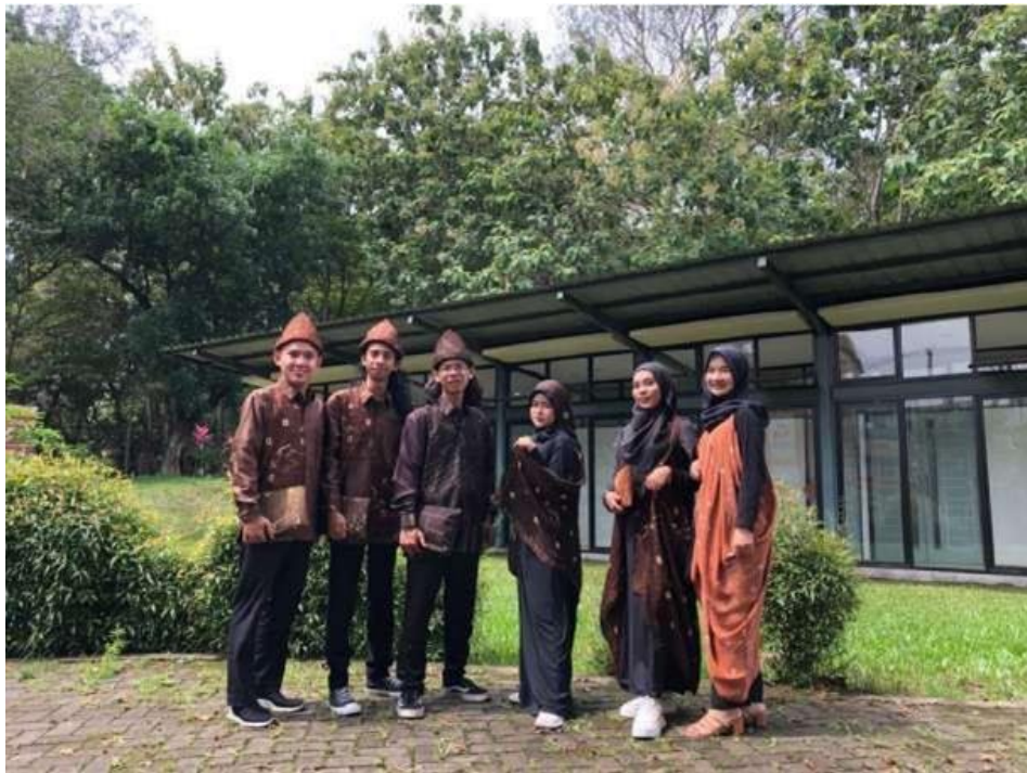
Figure 9. South Sumatran Youth Wearing Ulu Aksara Batik