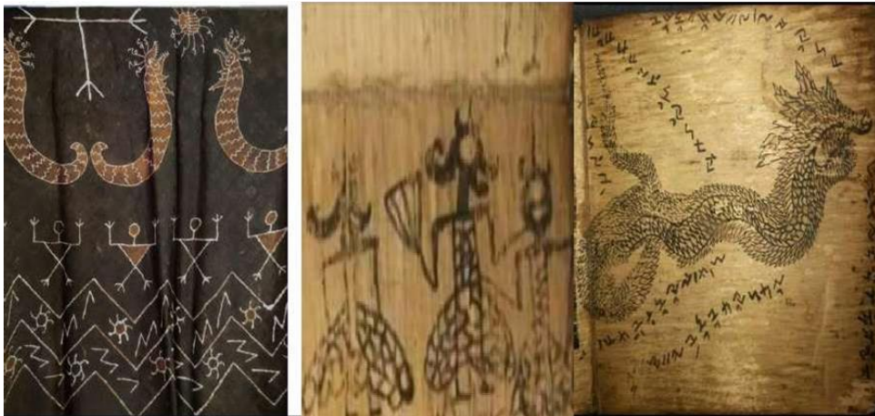
Figure 7. Design and Motif of Ulu Naga Batik