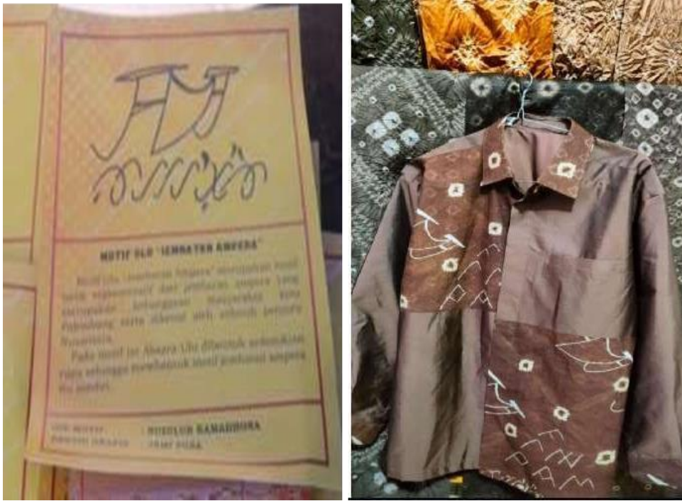
Figure 6. Design and Motif of Ulu Ampera Bridge Batik