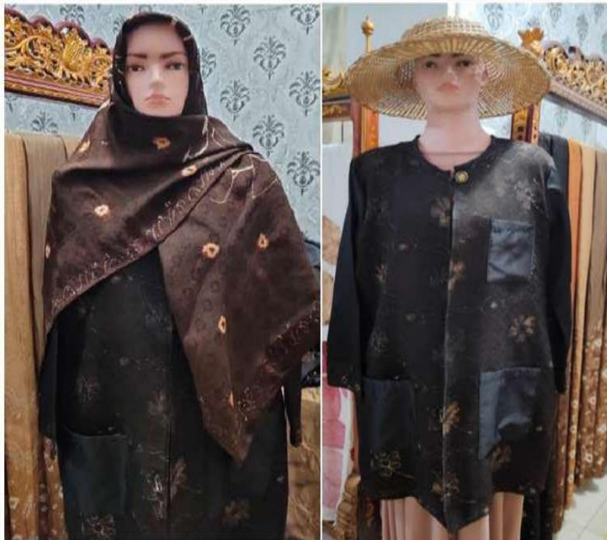
Figure 2. Design and Motif of Ulu Bunga Enim Batik