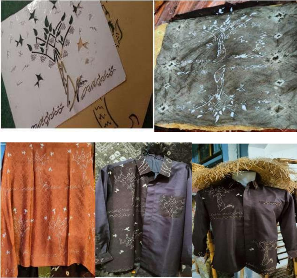
Figure 5. Design and Motif of Ulu Duku Komerling Batik (Source: Personal Documentation)