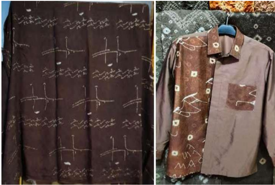
Figure 4. Design and Motif of the Komerling Dam Bridge Batik