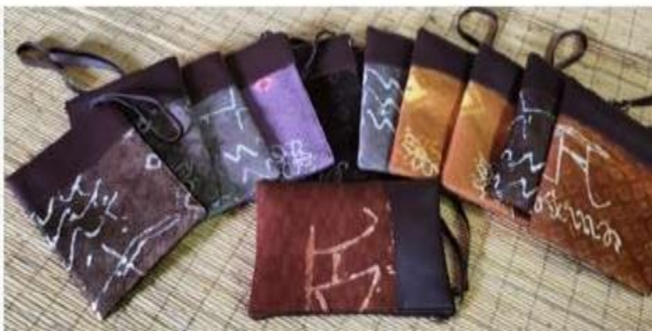
Figure 10. The work of Aksara lovers other than batik, namely head coverings and wallets that use Ulu script. (Source: Personal Documentation)