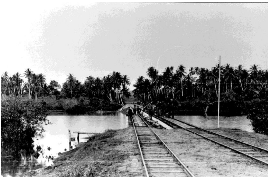
Figure 1. Two railroads over the river in Lhokseumawe built by the Dutch in 1930

Later, the Dutch East Indies reformed the administrative system by dividing administrative regions into onderafdeeling areas. Disguising titles of office and giving officials government duties. Not only taking care of trade and production but security justice. Colonial bureaucracy as a step towards a more modern process. Important changes that refer to modern values (Muhajir, 2018 ). In terms of appointing members of the bureaucracy, it was no longer based on genealogical ties as was done by the traditional royal bureaucratic system but based on rational criteria. In 1901, the Dutch adopted what they called ethical politics, in which the colonial government had a duty to improve people's welfare in health and education. Other new measures under the policy included irrigation programs, transmigration, communications, flood mitigation, industrialization and protection of indigenous industries (KIT Aceh No. 0093/022, n.d.).